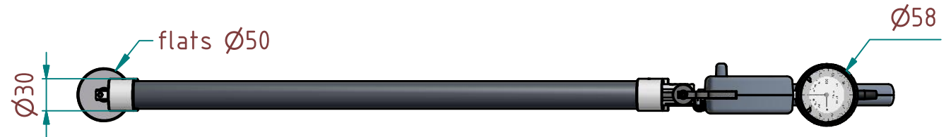
B ( 1 : 2 )